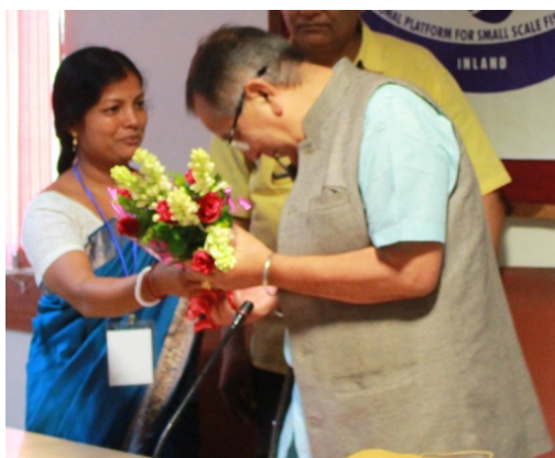
Felicitating Dr. R.K.Ranjan Singh, MP

Sri Pratap Chandra Sarengi, Hon'ble Minister of State in charge of Fisheries , said that he felt honoured to be present at a conference of fishing communities from 15 states. The fishing communities are the natural custodians of water bodies. Water is the mother of all life. The fishing communities are natural custodians of water bodies. They are under pressure. He said that the principles of Antodaya or Sarvodaya have to be revived and the people at the bottom should be helped to get their legitimate share. Quoting Mahatma Gandhi he said "We do not want mass production, we want production by masses" he said. He asked for the resolutions taken in the Conference and said that he will discuss the matters in detail.