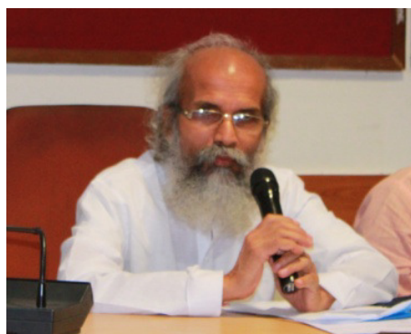
Hon'ble Minister Speaks

Sri Pratap Chandra Sarengi, Hon'ble Minister of State in charge of Fisheries , said that he felt honoured to be present at a conference of fishing communities from 15 states. The fishing communities are the natural custodians of water bodies. Water is the mother of all life. The fishing communities are natural custodians of water bodies. They are under pressure. He said that the principles of Antodaya or Sarvodaya have to be revived and the people at the bottom should be helped to get their legitimate share. Quoting Mahatma Gandhi he said "We do not want mass production, we want production by masses" he said. He asked for the resolutions taken in the Conference and said that he will discuss the matters in detail.