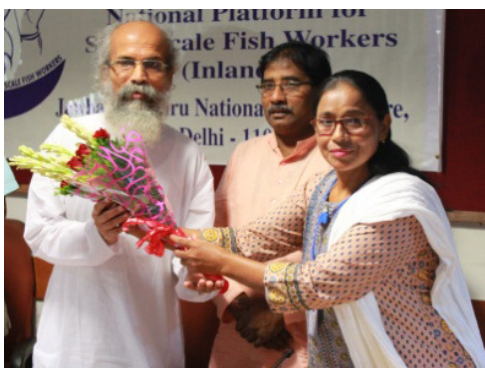
Felicitating Hon'ble Minister