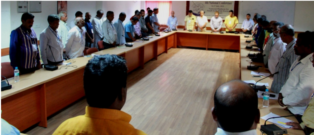
The House observes silence for one minute in respectful memory of departed community members and leaders