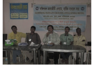
Leaders from Sundarbar

The Audited Accounts reflected the fund generated through membership drive initiated by DMF.